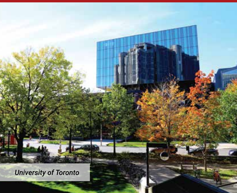
University of Toronto