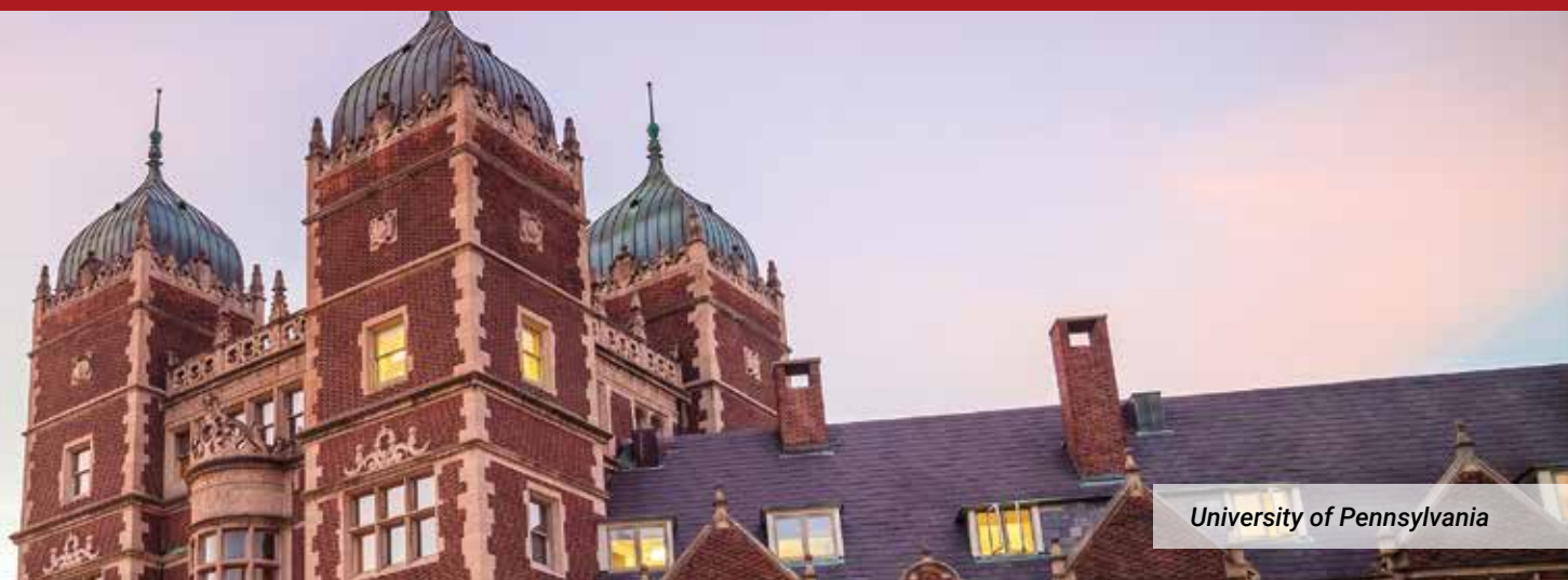
University of Pennsylvania