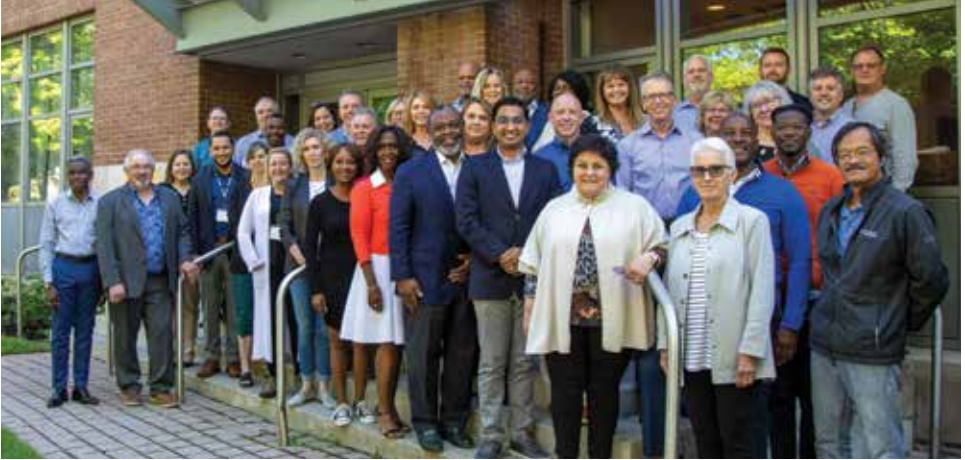
2022 CUES Governance Leadership Institute Graduates