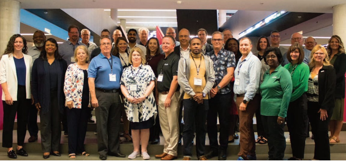
2023 CUES Governance Leadership Institute II Graduates